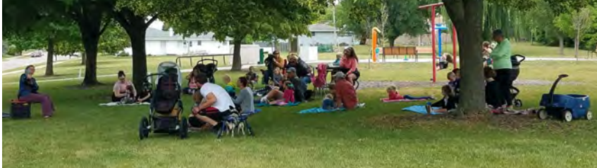
Schulte Park (Kenosha's southside also has a Splashpad)