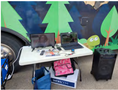
Oprah on screen reading the book, using the PYLE PA speaker for the families to hear the story before they tried the hula hoop challenge.

Things finally started moving in spring when we kicked off in April with a brand new afterschool “Music and Motion” program at one bookmobile stop with permission from the school principal. We had school families come out to join us at dismissal. The 8 stations of activities were spread out so families would not be close to each other. Bob the Fox (our mascot) even joined in the fun. Families were able to take turns using the bookmobile, sign up for library cards plus Moving and Grooving while waiting for their turn. We set up a monitor to play 'The Hula-Hoopin' Queen' read by Oprah Winfrey for a STORYTIME ONLINE. Then families could try hooping and challenge each other to see who was the best hula hooper. Here are highlights of the students moving and grooving.