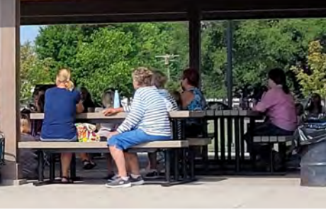
Kenosha DREAM Playground (an accessible park)