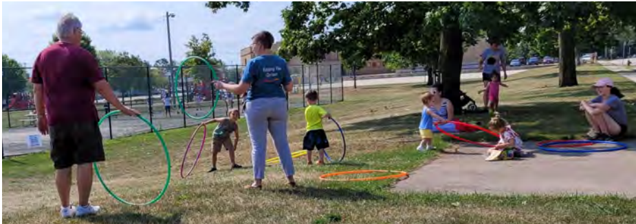
Roosevelt Park (a central Kenosha park with a Splashpad)