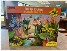
Busy Bugs Floor Puzzle