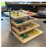
Chunky Puzzle Set