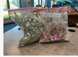
Toddler Sensory Bags