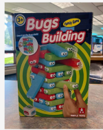
Bugs Building Game