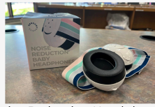
Noise Reduction Headphones (Baby)