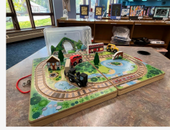
Portable Train Set