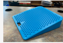
Sensory Seat Wedge (big)