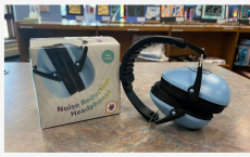
Noise Reduction Headphones