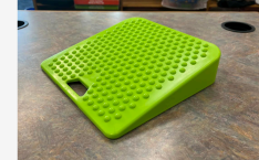
Sensory Seat Wedge (small)